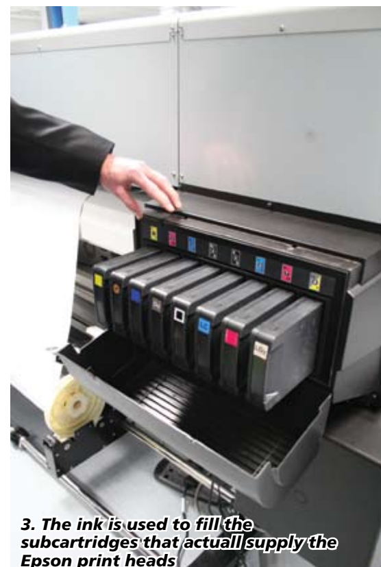
3. The ink is used to fill the subcartridges that actually supply the Epson print heads

now be able to combine high volume with high quality and high speed, because Colourgen has announced UK availability of the new Seiko I Infotech ColorPainter H-Series range of solvent inkjet printers. During a visit to its Maidenhead headquarters Sign World was witness to an exciting demonstration of the new Seiko H-104s production model that was all that Colourgen had available at the time to show just what it will have to offer when shipping of the new machine starts this January.