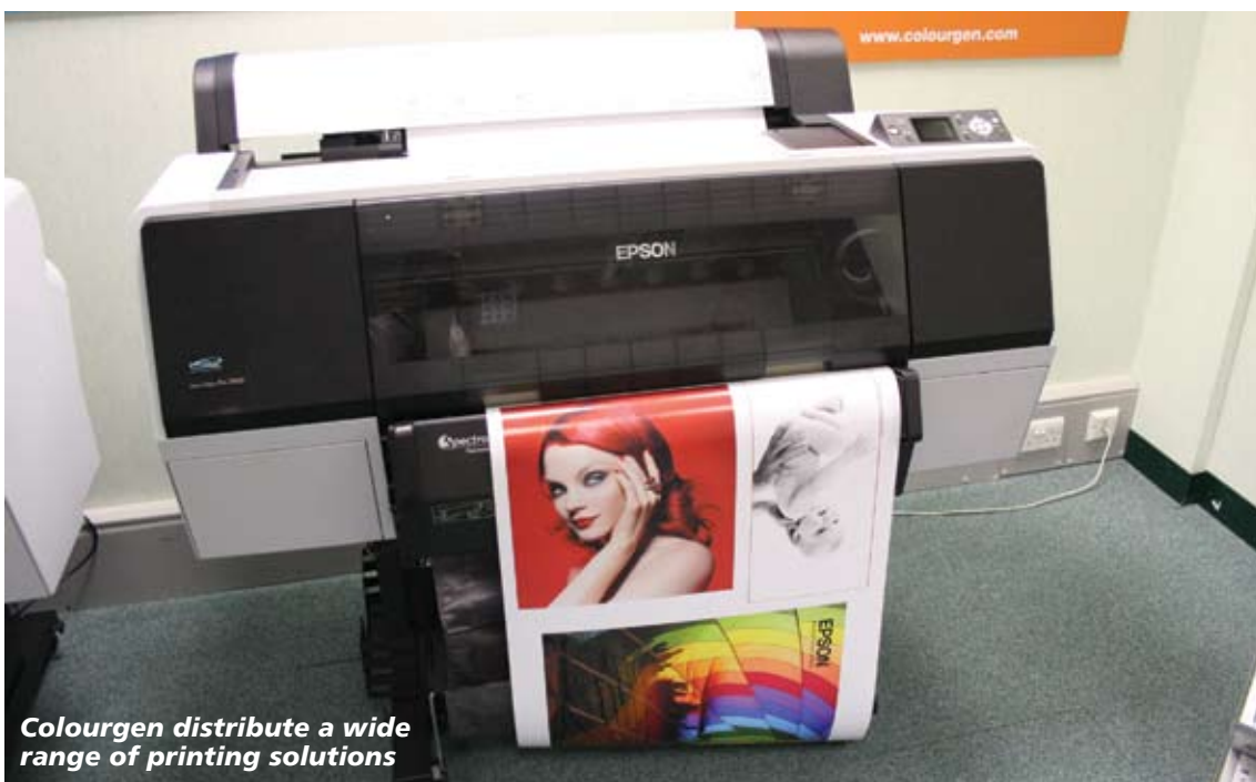
Colourgen distribute a wide range of printing solutions

"Mind you I think this looks pretty good. Seiko