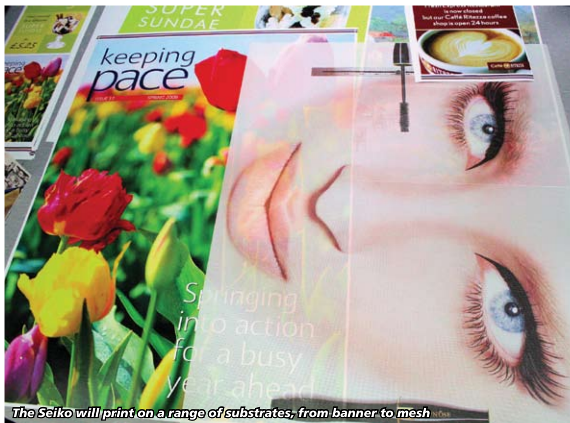
The Seiko will print on a range of substrates, from banner to mesh