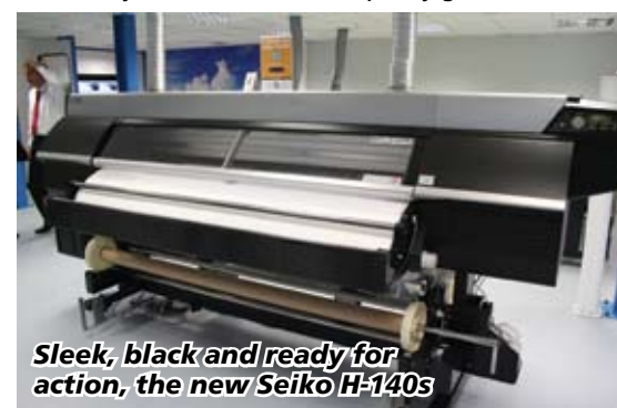
Sleek, black and ready for action, the new Seiko H-140s

have been a long time bringing this machine to the market and it really been worth the wait."