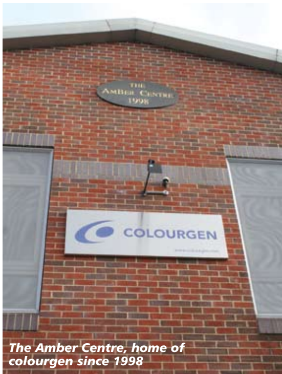
The Amber Centre, home of colourgen since 1998

The new machines comprise a perfect marriage of Seiko II technology with Epson print head expertise. We saw samples of print onto substrates as diverse as banner material, mesh, and even textured wall covering fabrics. At higher speeds the print quality can be a degree grainier but is still perfect for distance work such as building wraps and banners, but the high definition print is perfect for POS or back lit displays.