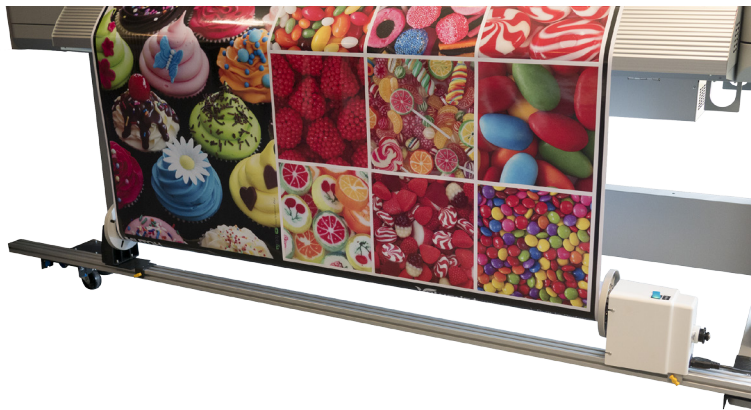
> ValueJet 1624 VJ1619-TUP30